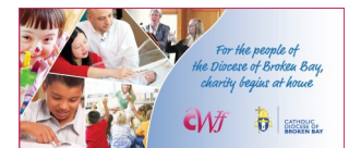
For the people of the Diocese of Broken Bay, charity begins at home